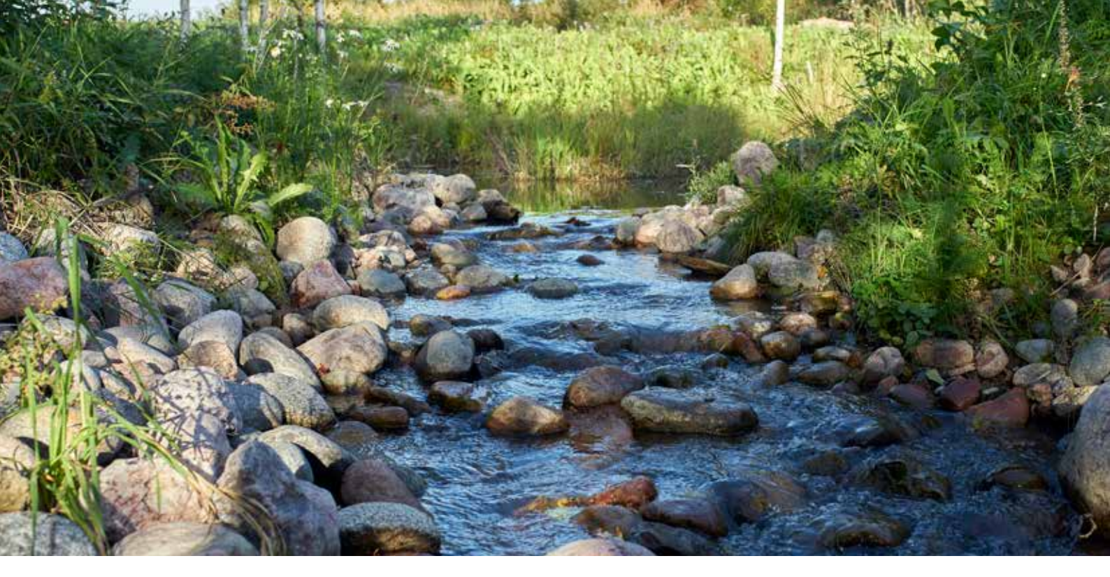
Rudus has been supporting the work of WWF Finland for the benefit of water bodies by giving away aggregates and their transportation for projects to create fish passes for endangered migratory fish and to prevent unwanted nutrient flow into inland waters and the Baltic Sea.